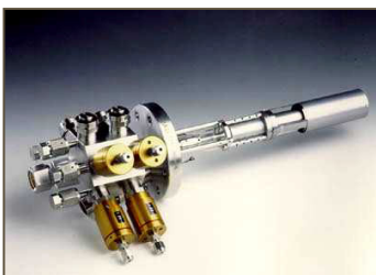
Ammonia delivery module