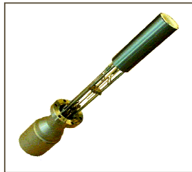
Group III Effusion cells